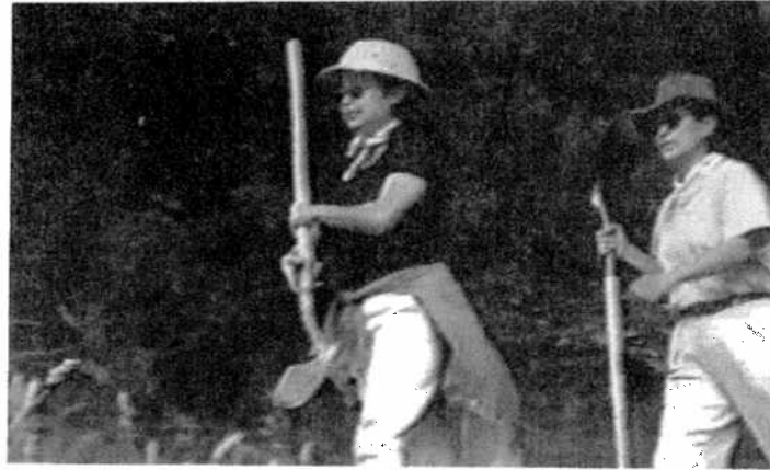
Marginal Eyes.